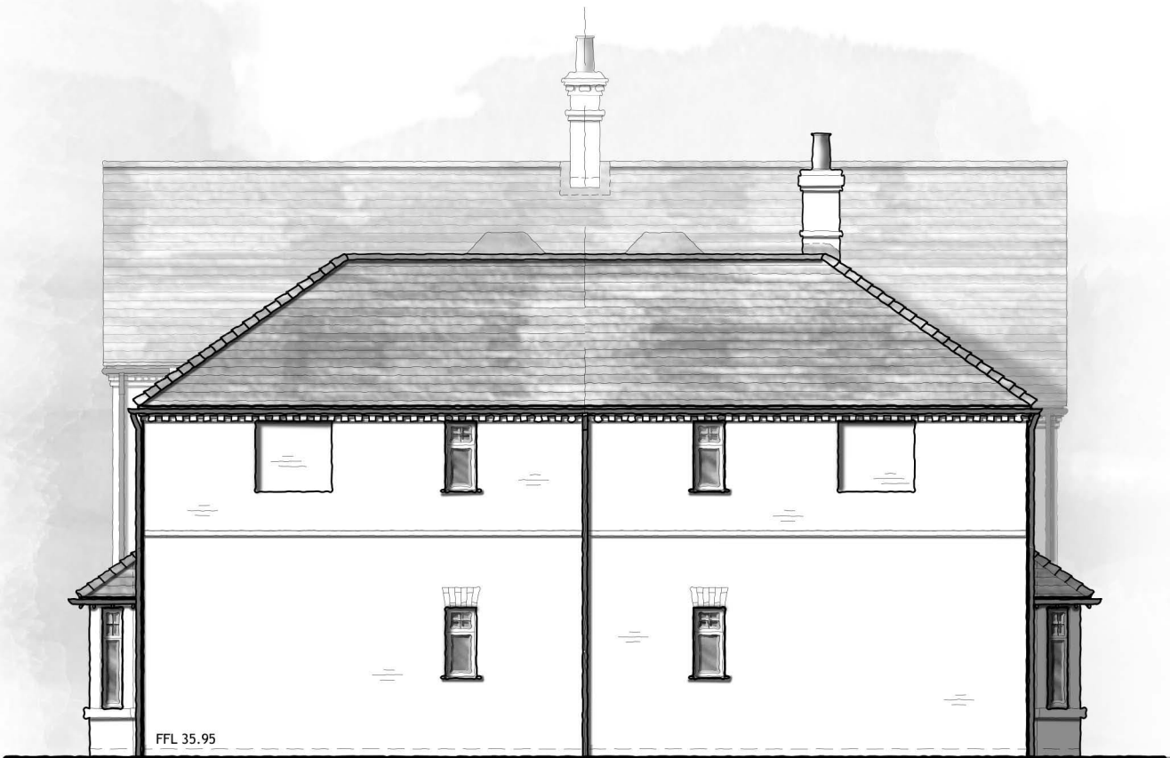
East Facing Elevation.