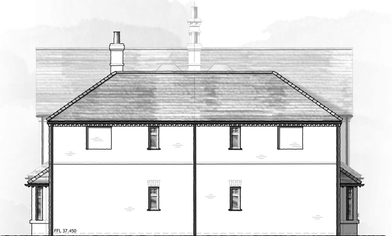
East Facing Elevation.