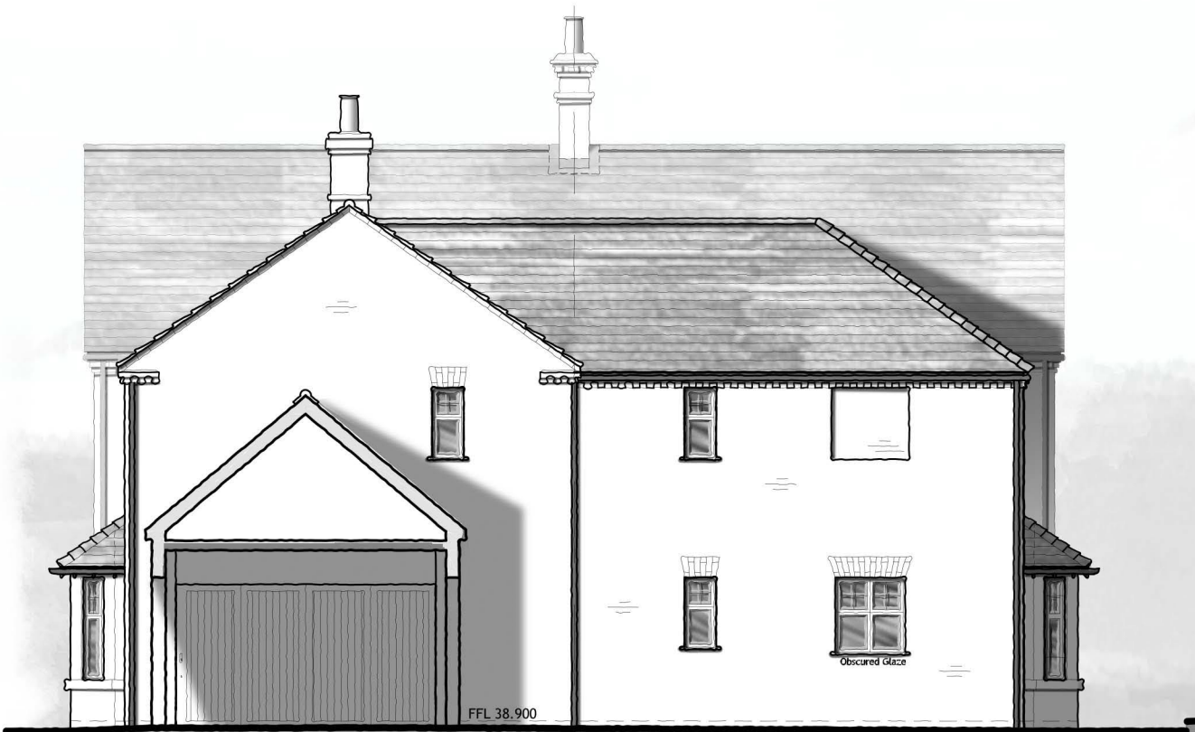
East Facing Side Elevation/ Section.