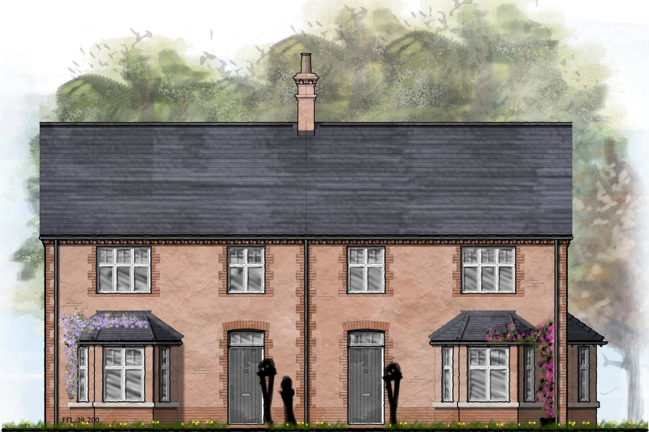
East Facing Elevation.