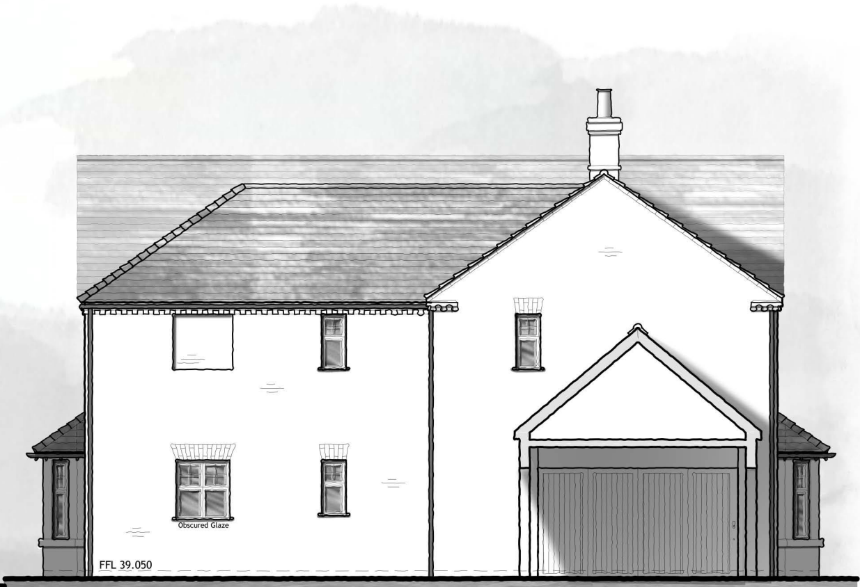
West Facing Side Elevation/ Section.