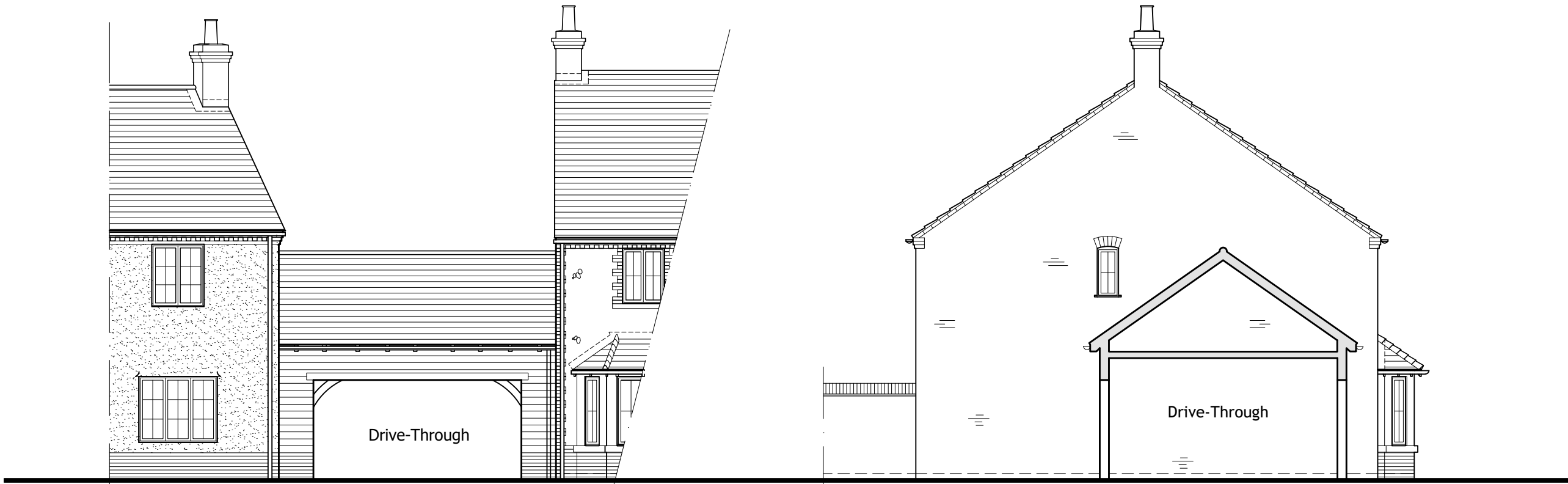
Adjoining C2 Type - Plot 263 Front Elevation