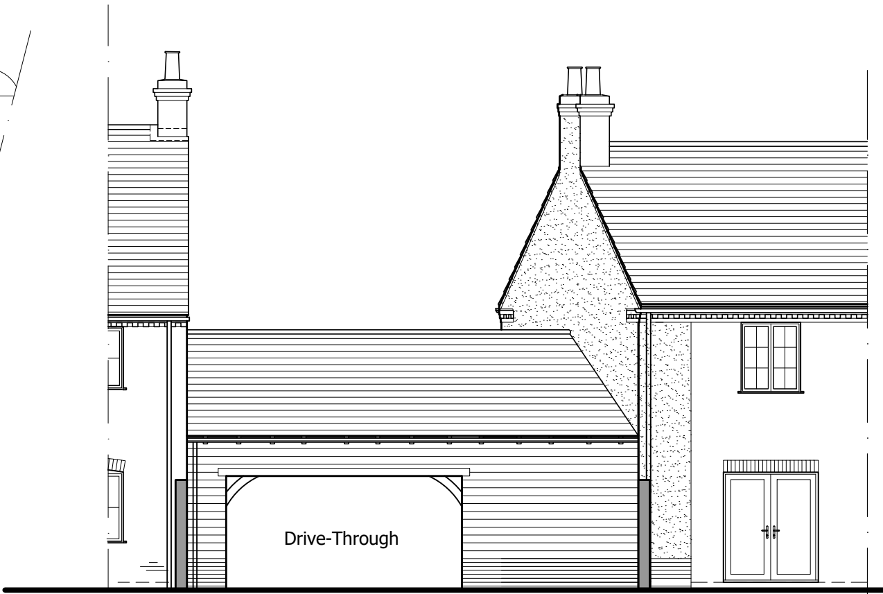
Adjoining B Type - Plot 264 Rear Elevation