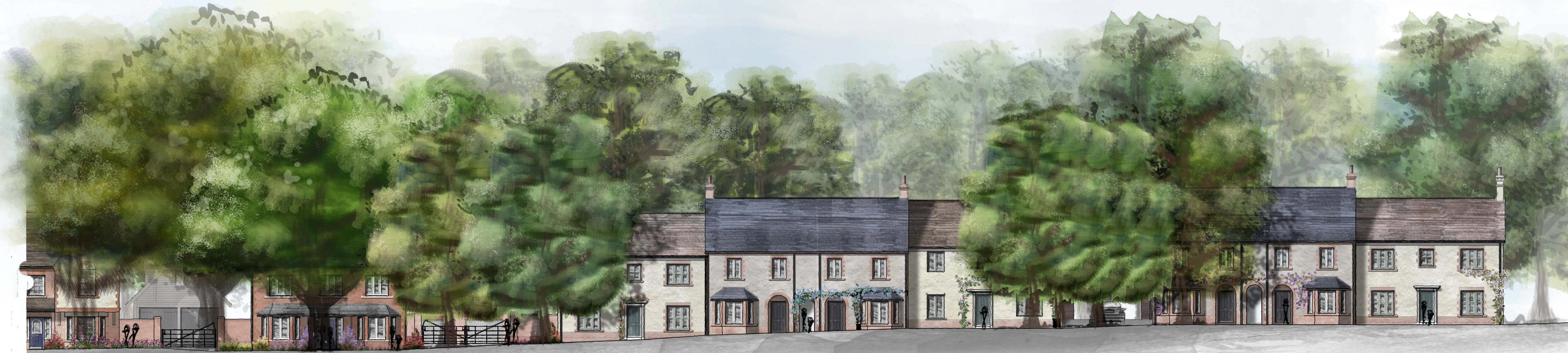
STREET SCENE 3-3