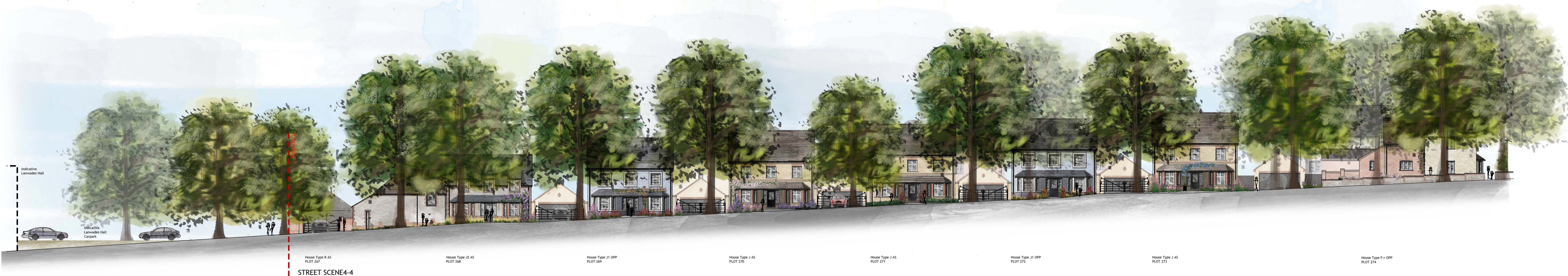
STREET SCENE 4-4