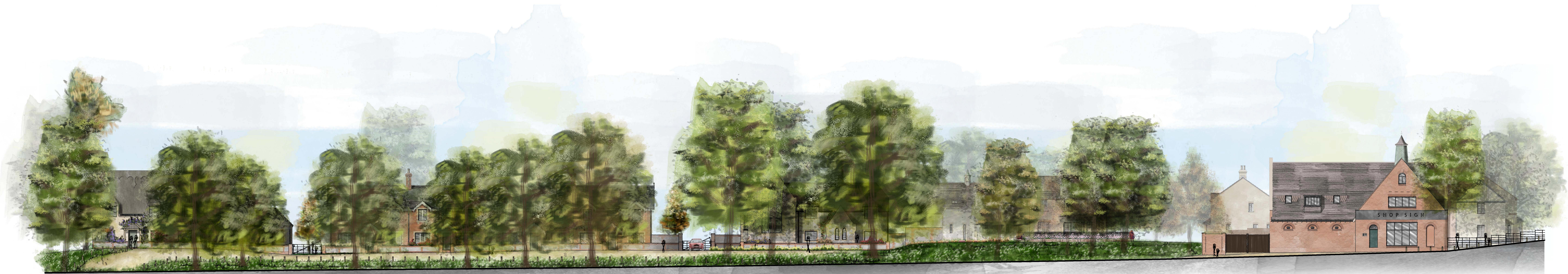
Street Scene 1-1