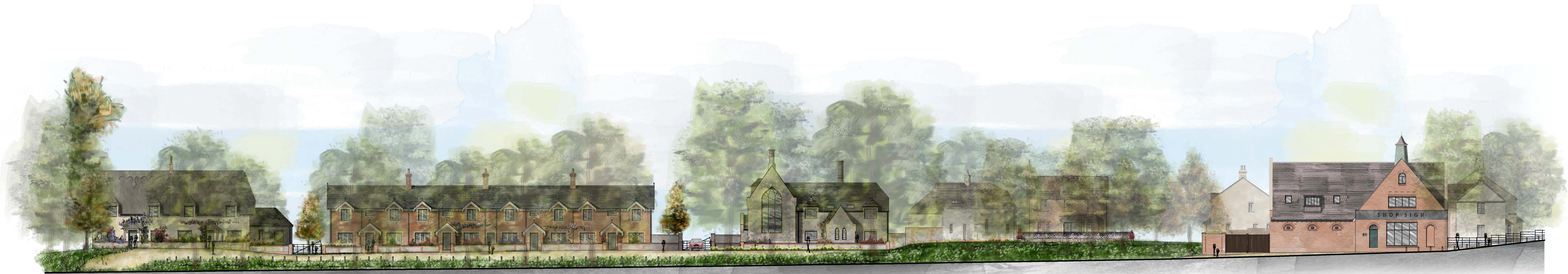
Street Scene 1-1