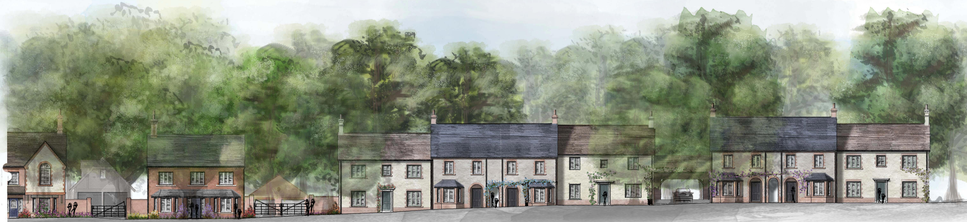
STREET SCENE 3-3