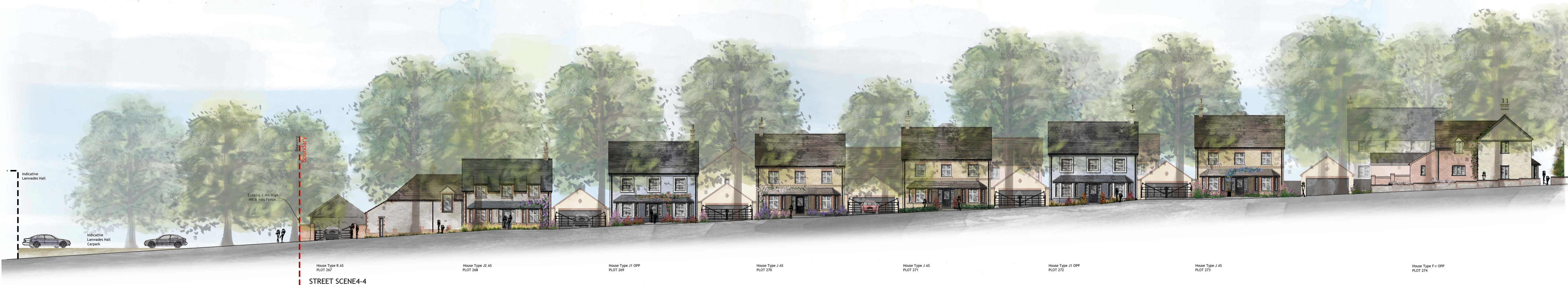
STREET SCENE 4-4