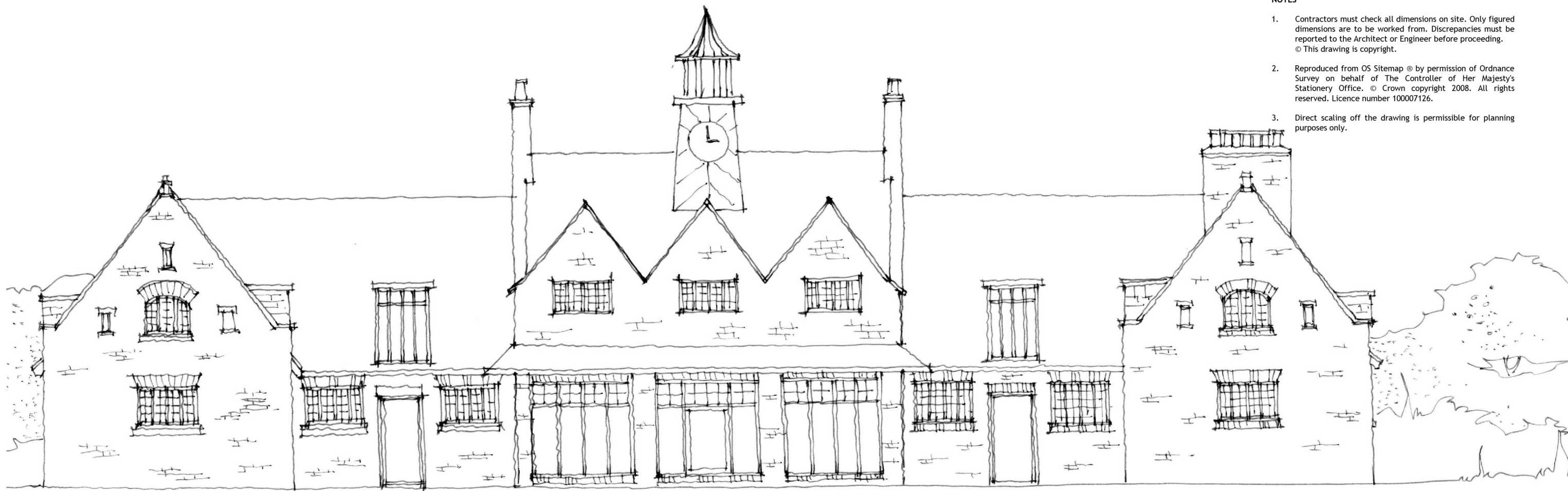
WEST (FRONT) ELEVATION